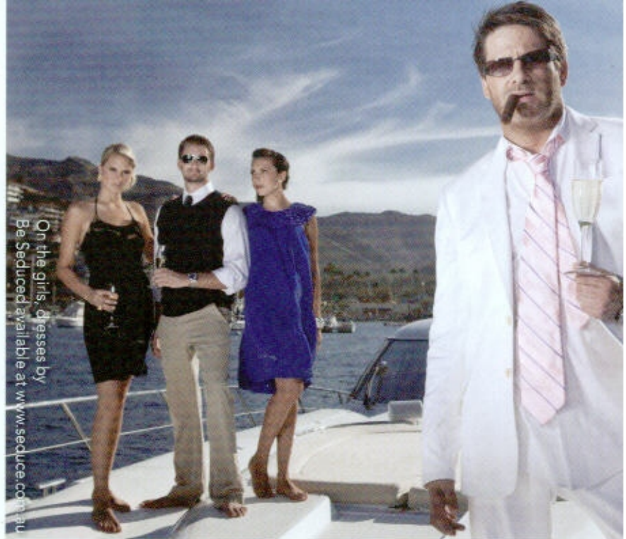
On the girls, dresses by Be Seduced available at www.seduce.com.au